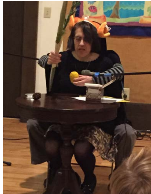
Rabbi and her lulav etrog lesson